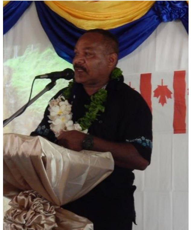
Vanuatu Minister of Health